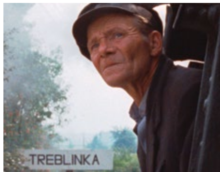
Still from Shoah