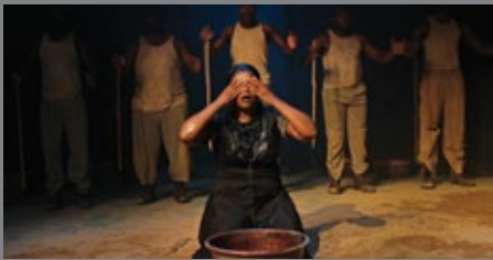
Still from The sinking of the Mendi

On the foggy morning of 21 February 1917, 600 men, mainly from rural Pondoland in the Eastern Cape, lost their lives when the troopship SS Mendi sank in a shipping accident just off the Isle of Wight. The men were on their way to support the British Army in France during World War I.