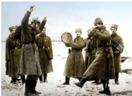
Apocalypse Episode 2: Russian and German soldiers have fun and dance together