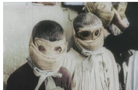
Still from Apocalypse Episode 3

Episode three of Apocalypse opens in 1916. The war is raging in Europe and