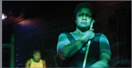
Still from The sinking of the Mendi

Ukutshona ko Mendi... Did We Dance (The Sinking of the Mendi) vividly retells this story. The title of the play is derived from a poem written by a survivor of the tragedy, S.E.K. Mqhayi, which records the oral legend of the barefooted “death dance” performed by the brave men of the labour contingent on the tilting deck of the Mendi before she plunged beneath the ocean. The men met their death with great dignity and courage, an act that has given its name to South Africa’s highest award for courage, the Order of the Mendi.