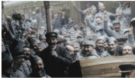
Still from Apocalypse Episode 5

In the final episode of Apocalypse , all seems lost for the Allies. The Italians are defeated at Caporette, and a Bolshevik Russia pulls out of the war. But the American reinforcements are decisive, and the Allies emerge victorious. The Allies are unable to negotiate an honorable peace agreement, and the Treaty of Versailles will have disastrous consequences 20 years later.