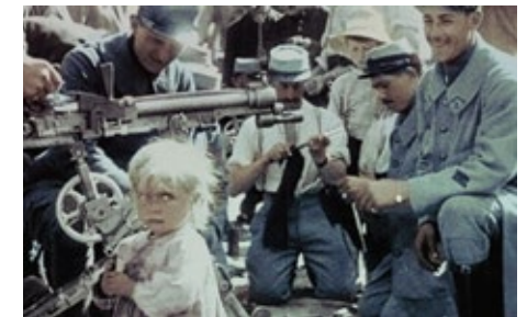
Still from Apocalypse Episode 1: No fear next to the terrible Hotchkiss machine gun

22/11/2014 AT 18H00 (THE STICK) AND 20H00 (MAJUB'S JOURNEY) THE BIOSCOPE, MABONENG PRECINCT, 286 FOX STREET, JOHANNESBURG