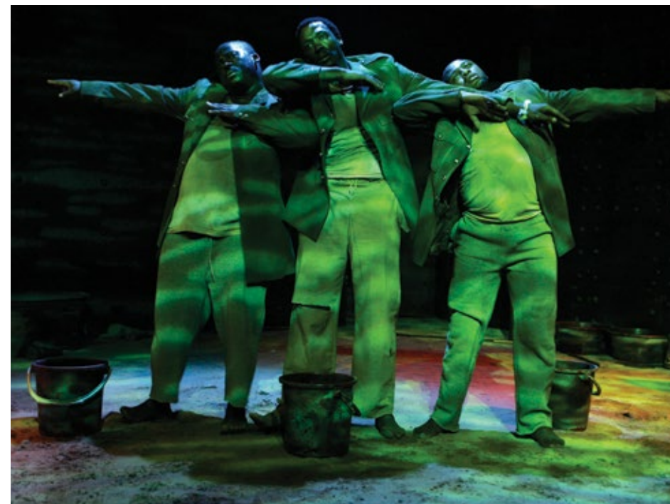
Still from Ukutshona ko Mendi... Did We Dance (The Sinking of the Mendi)

28/11/2014 AT 14H00 FOR 18H00 WISER, UNIVERSITY OF THE WITWATERSRAND, BRAAMFONTEIN, JOHANNESBURG