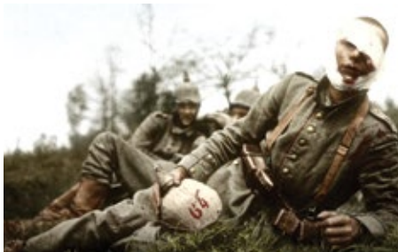
Apocalypse Episode 2: May 1915. The German soldier has been hit in the face by shrapnel

In the second episode of Apocalypse , the French army stops the German advance at the battle of the Marne, while the Germans halt the Russians at Tannenberg on the Eastern Front. In France, the warring parties dig themselves in for four years in the trenches. Soldiers from the colonies come and lend a hand to their colonisers and the war becomes global.