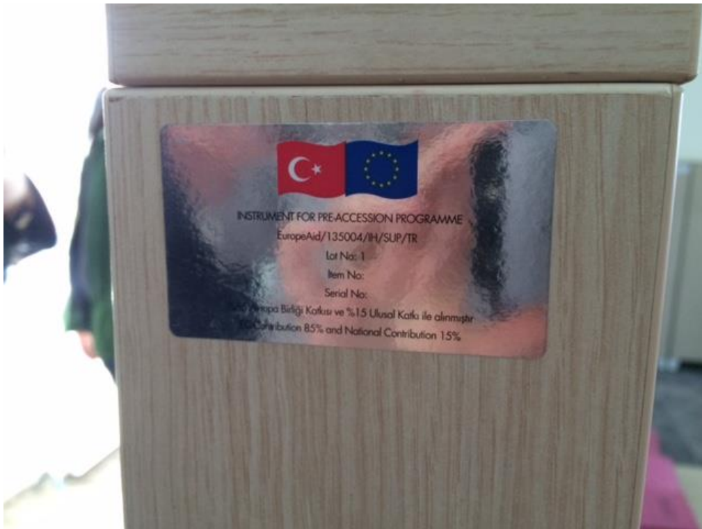
Sign showing EU 85% funding through the Instrument for Accession programme (sign visible on all furniture, towels, etc.)

The centre was financed (85 per cent) as a reception centre by the EU under the Instrument for Accession programme, but before it even opened, it was decided that the centre would be repurposed in the last quarter of 2015, and it was turned into a removal centre.